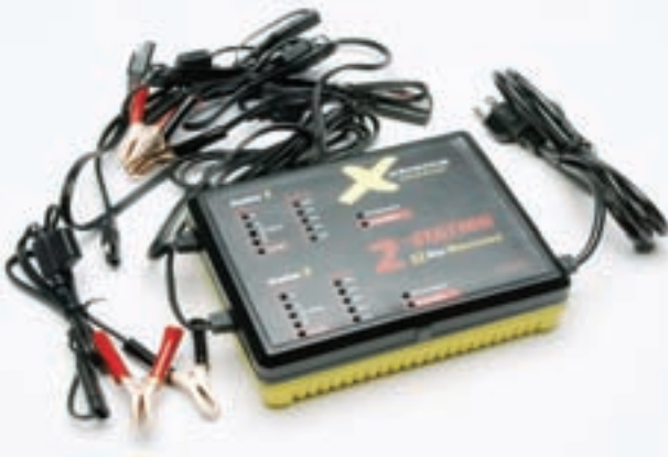
Xtreme Charge Dual Battery Charger & Maintainer