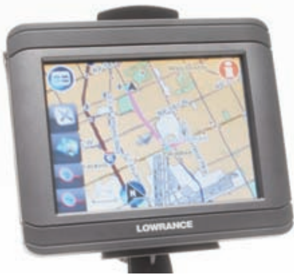
Lowrance weatherproof XOG Cross-Navigation GPS