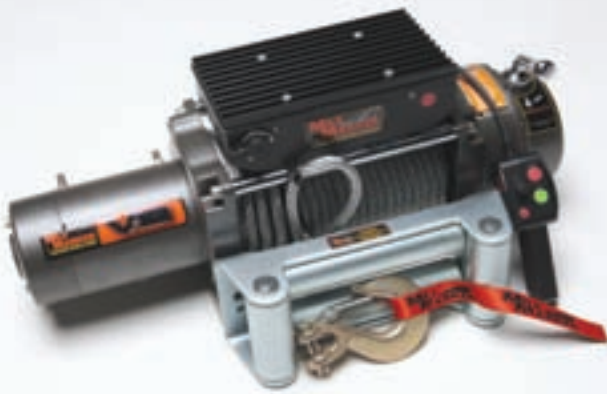
Mile Marker V-12 Recovery Winch