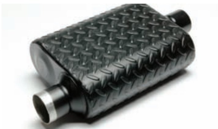
Flowmaster Super 44 Off-Road Muffler