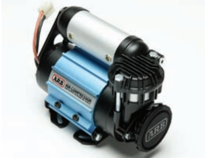
ARB High Output Air Compressor

For more information about these and other new products on display visit www.semadigital.com.