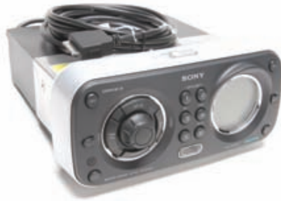
Sony CDX-H905IP splash-proof receiver