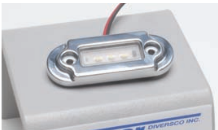
Hamsar weather-proof LED Light