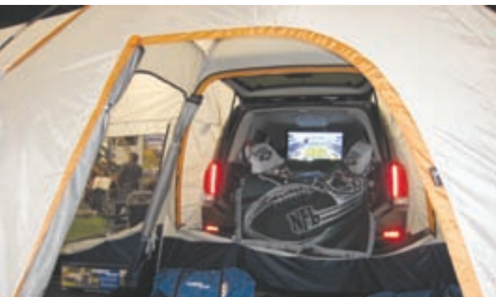
Napier SUV tent.