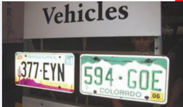
Plate Flipper shown in "running mode"