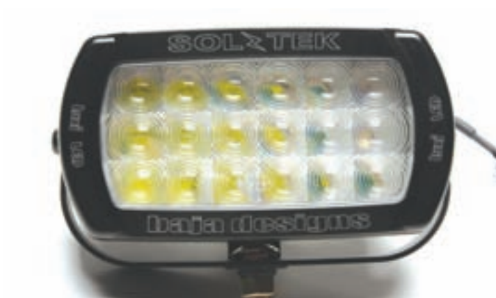
Baja Designs Soltek LED Light Systems