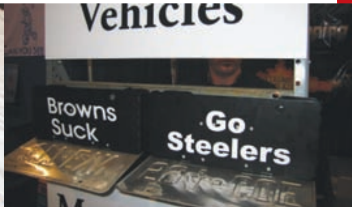
Now the flipped down view.