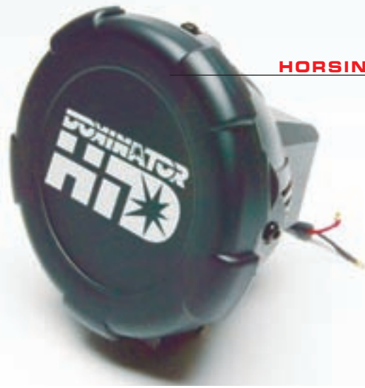
Lazer Star Dominator HID headlight